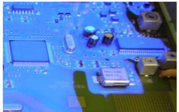
Figure 1: A Printed Circuit Board that has been selective coated by a robot

Whilst most machines have a tolerance and variation measured in microns for their dispense pattern positioning, most fluids have a very wide tolerance in properties by comparison, and are subject to flow and levelling forces that mean, as a rule of thumb, although the machine positioning capability is often better than 25 microns, one should allow as much as 2.5mm in variation due to the material properties.