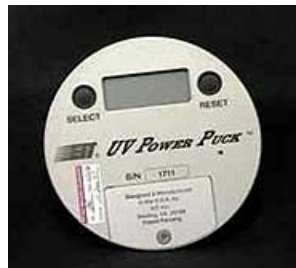
Power Puck radiometer

Controlling curing window process is easily quantifiable with a sensing system called a radiometer. This instrument measures the total UV dose and irradiance on 4 different channels (UV-A, UV-B, UV-C and UV-V) simultaneously, thus ensuring a repeatable and controlled curing process, while monitoring the output of the UV lamps. The procedure is as simple and fast as passing the instrument through the tunnel and removing it at the end while the radiometer is logging UV dose and energy.