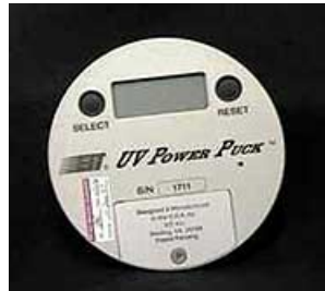
Power Puck radiometer

Controlling curing window process is easily quantifiable with a sensing system called a radiometer. This instrument measures the total UV dose and irradiance on 4 different channels (UV-A, UV-B, UV-C and UV-V) simultaneously, thus ensuring a repeatable and controlled curing process, while monitoring the output of the UV lamps. The procedure is as simple and fast as passing the instrument through the tunnel and removing it at the end while the radiometer is logging UV dose and energy.